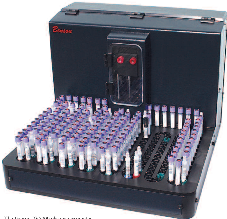
The Benson BV2000 plasma viscometer.